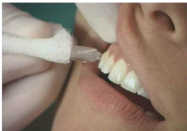
Figure 13. A clinical photograph demonstrates a reliable method and technique for performing the cold test.

When a patient reports a history of pain to a hot stimulus, then the clinician should logically conduct the “hot test”. A “toothache” precipitated by hot liquids or foods usually suggests an acutely inflamed or partially necrotic pulp. Necrotic tissue frequently harbors bacteria which can produce gasses that potentially expand against tissue encased inside unyielding dentinal walls. This phenomenon causes sensory fibers of the pulp to transmit pain. 21 There are a few different devices that may be selected to apply a hot stimulus, including the Touch ‘n’ Heat or System B (SybronEndo; Orange, California). Either device has a handpiece which is designed to receive various inserts such as the Hot Pulp Test Tip (SybronEndo; Orange, California). Regardless of the device chosen, the continuous mode is selected and the