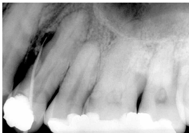
Figure 3. A radiograph of a maxillary first bicuspid showing a gutta percha point tracing a sinus tract and pointing to a lesion of endodontic origin.