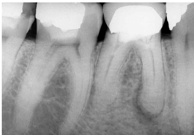
Figure 11c. A radiograph shows a mandibular first molar with a poor fitting crown, incomplete endodontics and a LEO associated with the mesial root.