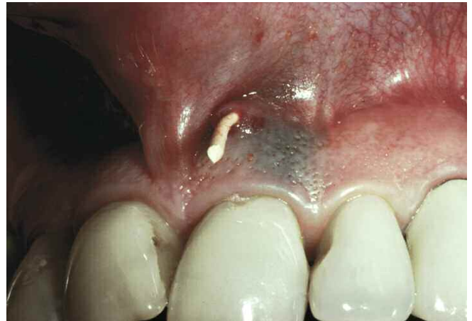
Figure 4b. A photograph demonstrates a gutta serena point tracing a sinus tract and a tattoo associated with an endodontically failing maxillary left central incisor.