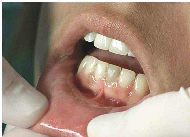
Figure 6a. A photograph shows discoloration of the clinical crown of the mandibular left central incisor as a result of a traumatic accident.

When performing the radiographic examination, the clinician will observe that different angulated images enhance detecting the location and extent of caries or recurrent caries. A restoration should be evaluated radiographically regarding marginal adaptation, contour, relative depth and relationship to the pulp chamber. At times, a bitewing film is useful as it can provide additional information as to splinted teeth, and the presence of pins and build-up materials. Radiographic images frequently allow the clinician to determine the size of the pulp chamber as compared to adjacent teeth, the presence of stones, and if calcific material projects into the coronal aspect of a canal ( Figure 3 ). Clinicians can visualize a radiograph to appreciate the crown/root ratio and orientation, and the angle of the coronal aspect of a canal relative to the long axis of the root ( Figure 7 ). Different, horizontally angled films disclose