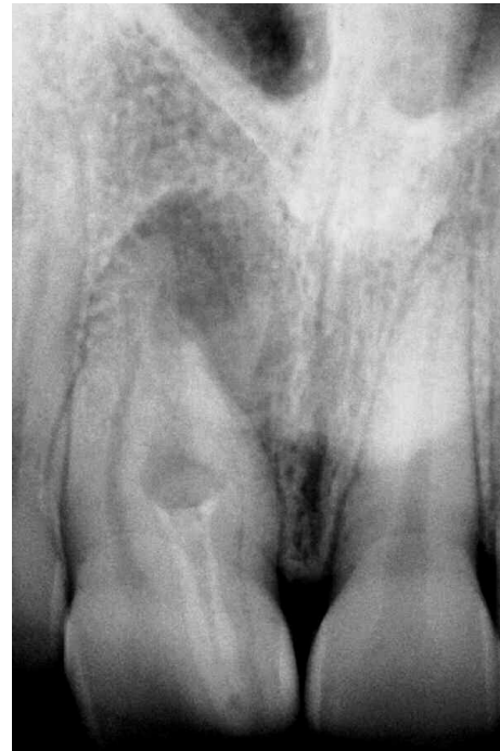
Figure 8. A radiograph suggests this maxillary right central incisor has a dens in dente, internal resorption, a large asymmetrical lesion and multiple canals.