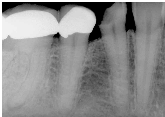
Figure 12. This radiograph suggests the mandibular first bicuspid has a carious pulp exposure and reveals a LEO associated with the mesial root of the molar.

Thermal tests should be conducted on the cervical aspect of a tooth, and as close as possible to the free gingival margin. This location represents the thinnest aspect of enamel or a restoration and, importantly, the closest distance to the pulp chamber. When performing a thermal test, the clinician is evaluating the "immediacy", the "intensity", and the "duration" of the response. The immediacy and intensity of a response to thermal testing can vary significantly depending on, as examples, the depth of a carious lesion, the placement of a new restoration, or recent periodontal surgery. It is useful to have the patient subjectively rate the intensity of a response utilizing a zero to ten (0-10) scale where zero (0) is a no response and ten (10) represents maximum pain. Regardless of the immediacy and intensity, if the response rapidly dissipates upon removing the thermal stimulus, then