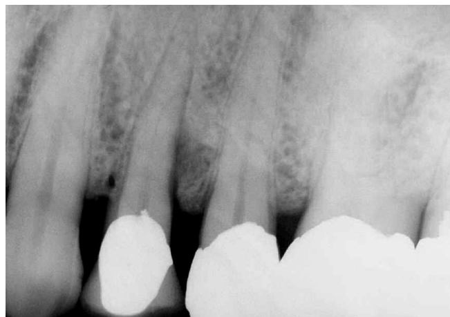
Figure 11b. A radiograph of an endodontically involved maxillary first bicuspid reveals a distocrestal lesion that is threatening the sulcus.