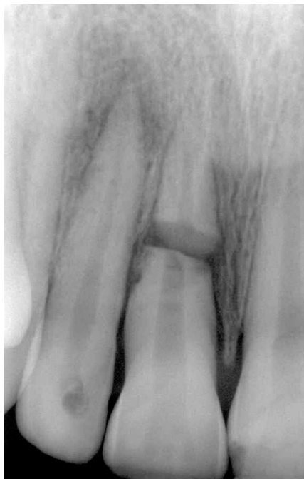
Figure 9. A radiograph of a maxillary central incisor reveals a horizontal root fracture with displacement and a previously accessed lateral incisor.