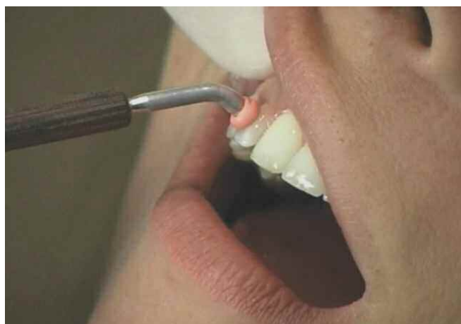
Figure 14. A clinical photograph shows the Hot Pulp Test Tip with thermosoftened gutta percha contacting the cervical aspect of a maxillary lateral incisor.

A comprehensive endodontic examination serves to systematically identify pulpally involved teeth and is critical for providing optimal dental care. The endodontic examination should be performed and the results recorded before initiating any dental procedure. Specifically, full mouth vital pulp testing procedures establish a baseline and provide information which can be utilized to make more predictable decisions. In many states, trained members of the dental team can legally perform and record the observations and results from the endodontic examination. Reliable information serves to improve diagnostics, treatment planning and patient communication. The comprehensive endodontic examination increases the possibility for patients to receive more timely care and for dentists to find the proverbial pot of gold! ▲