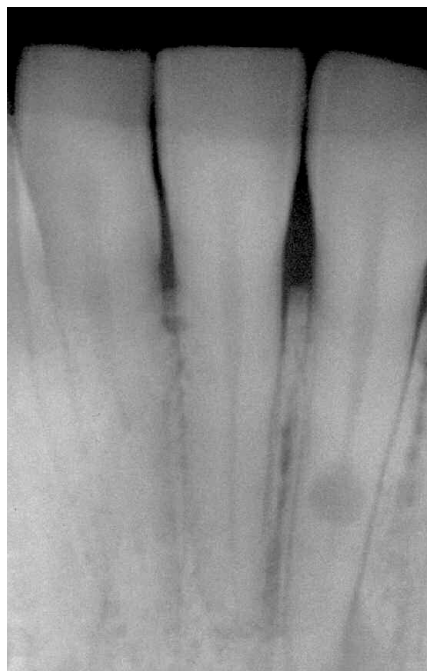
Figure 10a. A radiograph of a mandibular left lateral incisor shows evidence of internal resorption and an apical lesion of endodontic origin.