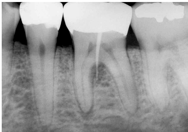
Figure 11a. A radiograph of an endodontically involved mandibular first molar showing a gutta percha point passing through the buccal sulcus to a furcal lesion.

The radiographic examination also provides information regarding the periodontal supporting structures. Certain probable defects masquerade as a periodontal lesion when, in fact, the etiology may be attributable to significant lateral canals disseminating pulpal irritants. 19 Clearly, pulp testing schemes must be conducted to corroborate this suspicion allowing the clinician to differentially diagnose the presence or absence of a LEO. Over time it is becoming well understood that LEO's occur in the furcations of multi-rooted teeth ( Figure 11a ). Additionally, a LEO may be positioned crestally, laterally along a root surface, or symmetrically or asymmetrically around the apex of a root ( Figures 11b, 11c ). It must be understood that radiographic radiolucencies or radiopacities could represent a normal anatomical landmark, a nonodontogenic lesion, or a LEO, and the differential diagnosis is made by performing vital pulp tests. 20