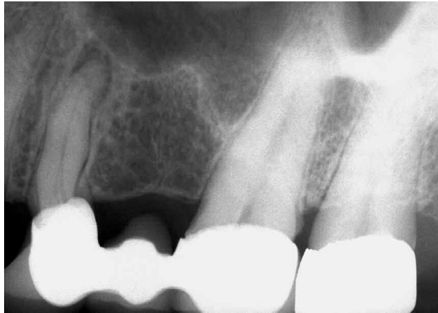
Figure 7. A radiograph suggests the anterior bridge abutment is endodontically involved. Note the crown/root orientation and inclination of the canal coronally.

( Figure 9 ). The clinician needs to carefully observe films for the possible sequelae to traumatic events, such as internal and external resorptions ( Figure 10 ). High quality images clarify root end proximity to normal anatomical structures such as the maxillary sinus, mental foramen or mandibular canal. In fact, at times clinicians should expose a contralateral film to rule out a normal radiolucent anatomical landmark versus an abnormal radiolucent lesion. At times, additional films may be prescribed to augment an examination; including a panograph, lateral jaw, or occlusal radiograph. Diagnosticians should