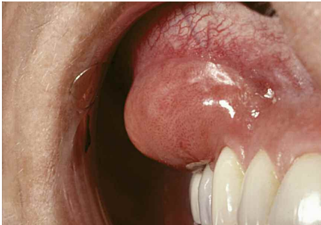
Figure 4a. A photograph reveals significant swelling secondary to a LEO that has broken through the buccal cortical plate of bone.

The intraoral hard tissue exam reveals missing teeth, fractured teeth, dark teeth and developmental anomalies ( Figure 6 ). Further, all existing restoratives are evaluated for marginal adaptation, contour and esthetics. The diagnostician looks for caries, recurrent caries, and inspects the cervical area of teeth for erosions, abrasions and abfractions. The presence of inflammation or infection can contribute to the loss of attachment and excessive mobility of a tooth. Roots should be palpated laterally and apically, both on the facial and lingual aspects as a lesion of endodontic origin can invade through the cortical plate. The percussion test is performed gently and conducted laterally, then vertically on the incisal edges of anterior teeth or on the buccal and lingual cusps of posterior teeth. A positive percussion test indicates an injury to the attachment apparatus, may cast suspicion regarding the status of the pulp, but, in and of itself, does not disclose information regarding the health of the pulp. The bite test is useful to identify teeth with incomplete or complete dentinal fractures and is best performed with a cotton roll, q-stick or the Tooth Slooth (Sullivan Schein Dental; Melville, New York). These devices are placed interocclusally and patients are instructed to initially bite gently and, if possible, to then bite firmly. Additionally, patients should demonstrate they can