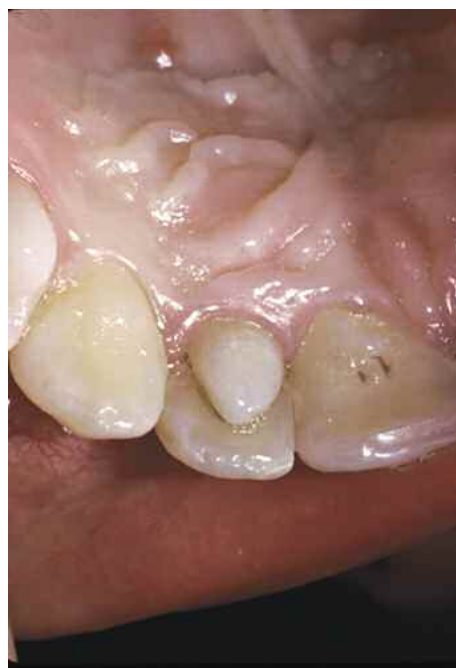
Figure 6b. A clinical photograph of the lingual surface of this maxillary incisor reveals a dens evaginatus and a sinus tract located high in the palatal vault.