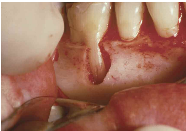
Figure 5. A surgical photograph of an endodontically failing molar reveals a vertical root fracture possibly caused by the use of excessive force during obturation.