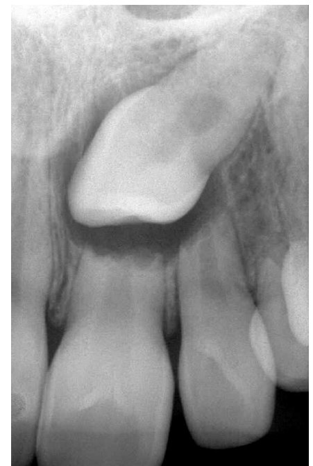
Figure 10b. This radiograph reveals massive root resorption associated with the maxillary incisors possibly caused by the erupting and mesially inclined canine.